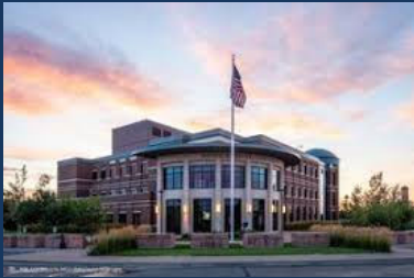
Missouri River Federal Courthouse Great Falls, MT