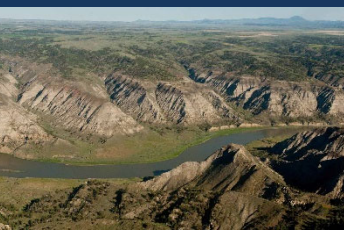
Charles M. Russell National Wildlife Refuge