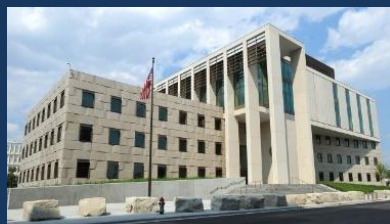
James F. Battin Federal Courthouse Billings, MT